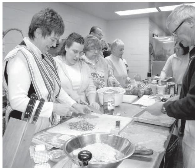
ACC Community Education participants learn to prepare new meals during a class in 2011.